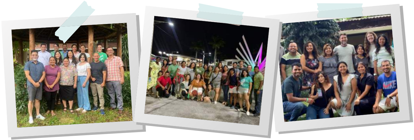
Partners and Caminantes during Module 4 of Faithwalking.